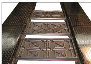
FOUR (4) DRIP TRAYS